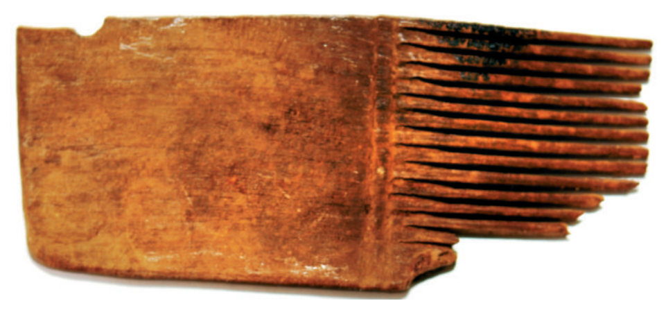
Fig. 1. Wooden comb excavated in the 'Cave of the Pool'