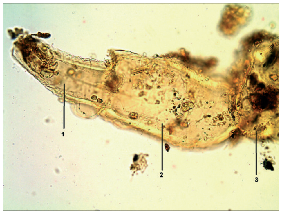
Fig. 3. Apical part of leg of first instar nymph of Pediculus humanus capitis , found in wooden comb from the 'Cave of the Pool': tarsus (1), tibia (2) and femur (3)