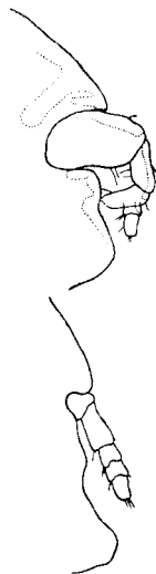
FIG. 2.— Goniodes corpulentus , n. sp., antenna of male above, of female below.

Description of the male. Body, length 2 mm.; width .97 mm.; golden brown, with darker markings; short robust body. Head, length .64 mm.; width .64 mm.; front flatly convex, with a rather broad colorless border, and with eight very fine hairs on margin and a longer hair in front of each antenna; temporal region distinctly angulate, slightly expanded, the angle with one very long hair and a shorter one; occipital margin shallowly concave; occipital band strongly sinuous; antennal bands straight, diverging to angle of front; antennal