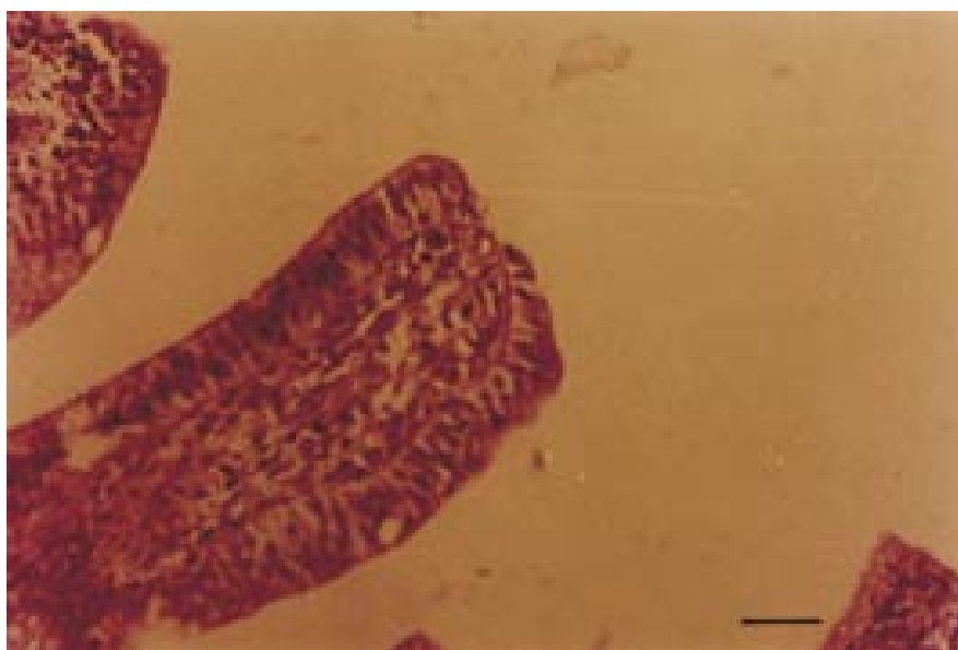
Fig. 4. Histopathological changes in the spleen of a chicken, experimentally infected with biting lice. Scale bar = 25 \mu m.