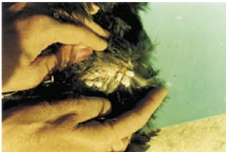
Fig. 1. Conglomerates of Eomenacanthus stramineus eggs at the base of feathers around the cloaca of a chicken.