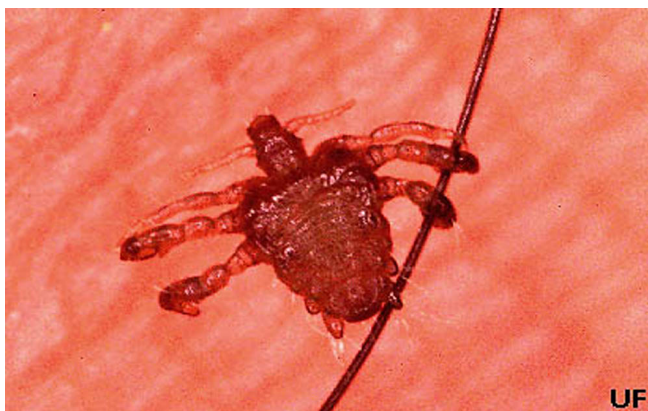
Figure 3. Crab louse, Pthirus pubis (Linnaeus). Credits: University of Florida

The crab louse may be distinguished readily from the body louse or head louse by the following: forelegs delicate, with long, slender claws; other legs very stout, with short, stout claws; thumblike process of tibia short and stout; abdomen very short and broad; segments 1-5 closely crowded, thus the stigmata of segments 3-5 apparently lying in one lateral processes. All legs of the body louse or head louse are stout; thumblike process of tibia very long and slender, bearing strong spines, forelegs stouter than the others; abdomen elongate, segments without lateral processes.