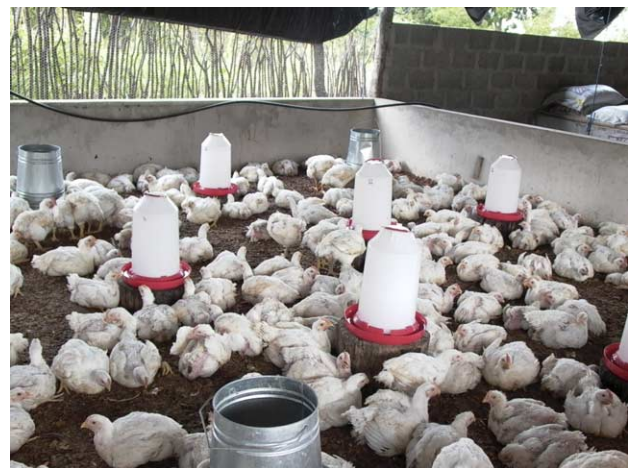
Fig. 3. Typical broiler pen, Isabela Island, Galápagos.