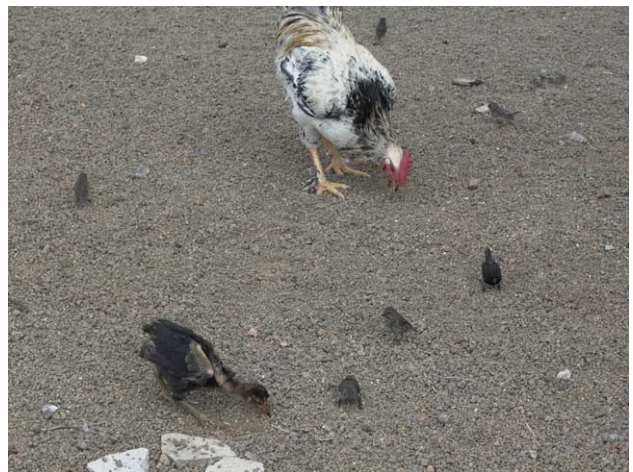
Fig. 2. Backyard chickens mingling with Darwin's ground finches ( Geospiza sp.) on Floreana Island, Galápagos.

In contrast, the numbers of domestic chickens are increasing in inhabited areas of the Galápagos. Domestic chickens are present on Santa Cruz, Isabela, San Cristobal, Floreana, and Baltra (Fig. 1). Three types of poultry farming are practiced on the Galápagos Islands: small-scale backyard meat chickens (1–40 birds per farm) (Fig. 2), small to medium-scale egg layers, and medium to relatively large-scale commercial broiler operations (2000–4000 birds) (Fig. 3). Currently, there are 23 broiler chicken farms on Santa Cruz, 6 on San Cristobal, and 4 on Isabela. In the past five to ten years, poultry production has intensified due to demand from the growing human population and tourist industry. Under Galápagos law, broiler chickens, brought to Galápagos at 1–5 days of age, must be unvaccinated and certified as healthy by approved aviculture facilities on the Ecuadorian mainland. Currently, no livestock vaccinations are permitted on the Galapagos Islands (David Cruz, SIC-GAL, personal communication). Feral populations of