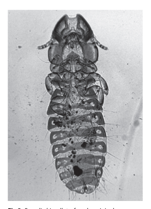
Fig 3. Brueelia biocellata , female, original Şekil 3. Brueelia biocellata , dişi, orijinal

to exceed 500 species <sup>8</sup>. However, almost all of the louse fauna of these birds are still unknown.