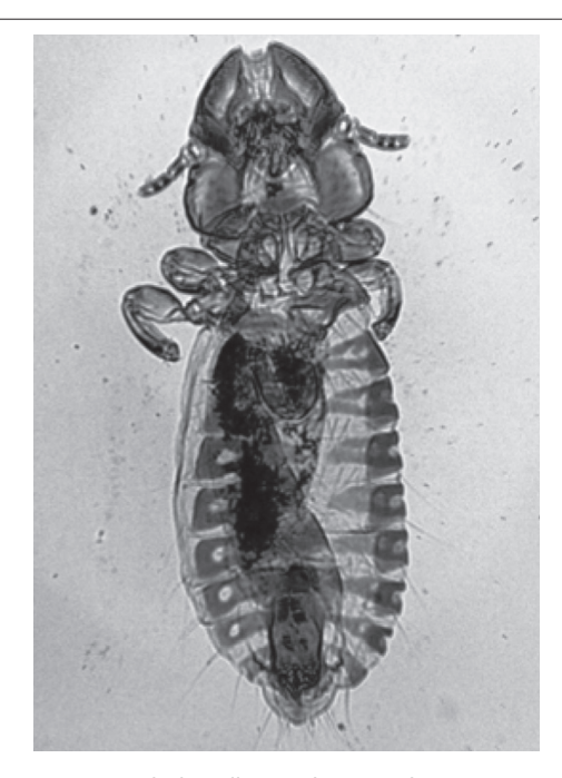
Fig 2. Brueelia biocellata , male, original Şekil 2. Brueelia biocellata , erkek, orijinal

Approximately, 4000 valid lice species were found on the birds throughout the world <sup>2</sup>. There are 468 bird species recorded in Turkey so far and the actual total is likely