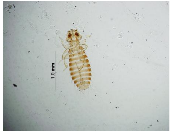
Fig. 5. Ciconiphilus decimfasciatus , adult male, host: Egretta garzetta (Little Egret), (original)