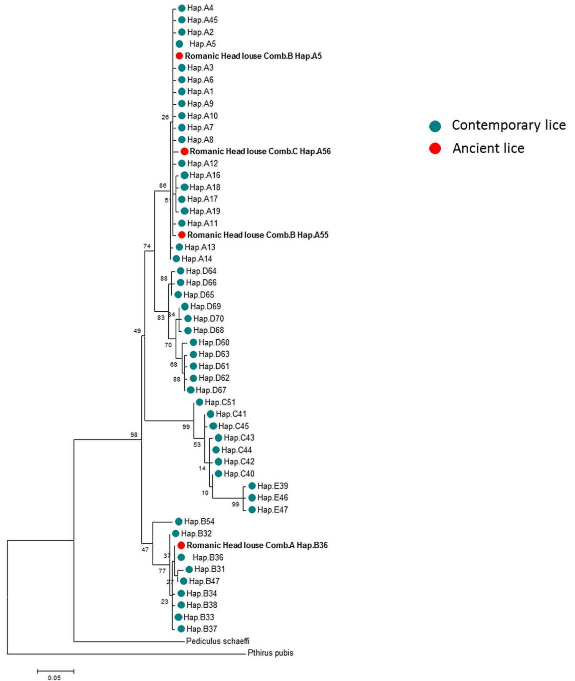
Fig 3. Maximum-likelihood (ML) phylogram of contemporary and ancient haplotypes of Pediculus humanus based on the partial 272-bp cytb gene with Pediculus schaeffi (KC241883) and Pthirus pubis (EU219990) as outgroups.