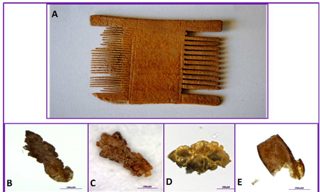
Fig 1. Recovery of ancient human head lice from a two-sided louse comb belonging to the Roman period (A) recovered from the Judean desert and Arava regions of Israel. In the lower part, entire specimens (B and C), the head and thorax of a head louse (D) and a damaged non-operculated egg (E) can be seen.

Head lice and their eggs were isolated from three louse combs from the Roman period (1 st century AD to 6 th century BC). Comb A and Comb B were recovered from archaeological excavations in Moa, in the Arava region, close to the Dead Sea, while Comb C was found in the Hatzeva area of the Judean desert (between Jericho and Dead Sea). In Moa, the excavations were conducted between 1981 and 1985 (permit no. A-1016/1981). The site appears to be a way station on the Spice Route connecting Petra to Gaza, where the remains of a caravanserai, a fortress and a temple were found. The excavation site in Hatzeva was a fortified road station from the Nabatean period in an agricultural settlement from the Early Arabic, late Roman period. The three combs were two-sided (Fig 1). From comb A, six lice parts and four eggs were isolated, from comb B, one entire specimen of male and nymph, respectively, eight lice parts and three eggs while from comb C only one entire nymph was isolated. All of the lice remains were preserved dry under sterile conditions. Morphological examination revealed that