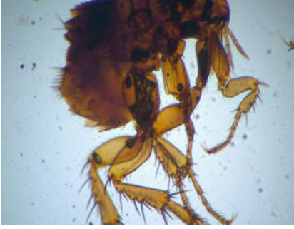
E. Ctenocephalids sp.