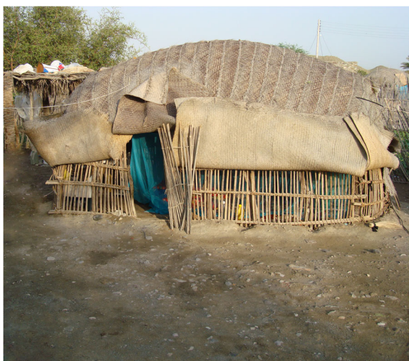
Fig. 1 Sheds made of palm leaves, a living place for people in Bashagard County, southeast of Iran

Students of study villages and their family were informed about the objectives and procedures of the investigation. The parents signed a consent form and the students