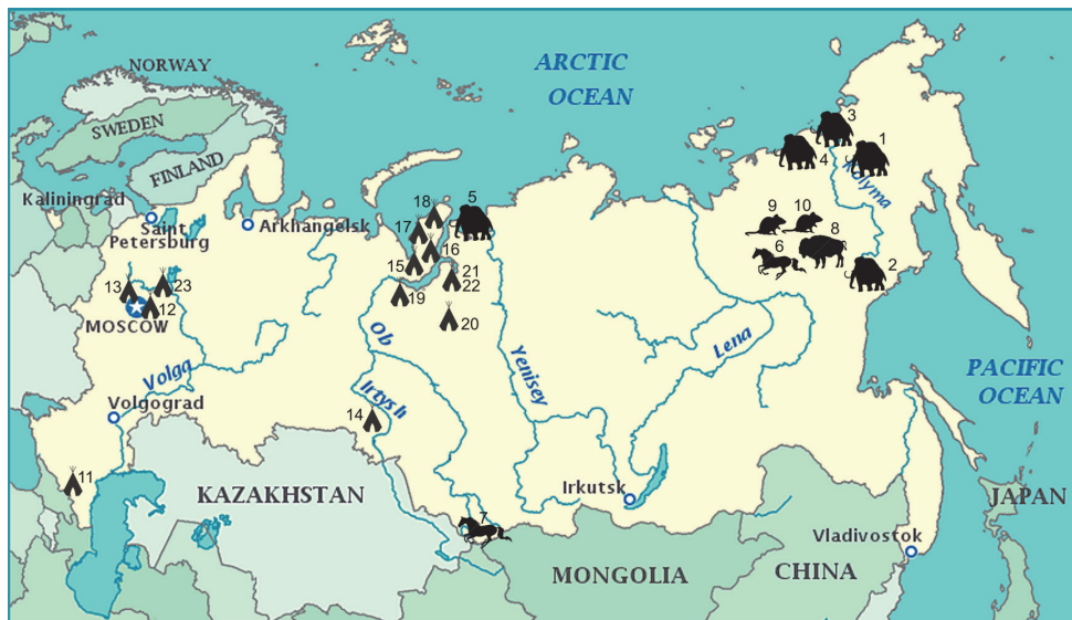
FIGURE 1. Location of Paleoparasitological investigations (the map from http://kimkardashiani.blogspot.ru ). The finds of parasites in Proboscidea: 1 – the Beryozovsky mammoth, 2 – the Kirgilyakh mammoth, 3 – the Shandrin mammoth, 4 – Berelekh mammoth cemetery, 5 – the Zhenya Mammoth; in Perissodactyla: 6 - the Selerikan horse, 7 – horse from Ukok burial; in Artiodactyla: 8 – the Indigirka bison; in Rodentia: 9 – the Indigirka ground squirrel, 10 – Egorov's narrow-skull vole. The finds of parasites at the archaeological sites: 11 – Caucasus dung deposits, 12 – Voymezchnoe, 13 – Zamostye-1, 2; 14 – Maray-1, 15 – Yarte-6, 16 – Nadym settlement, 17 – Ust-Voikar, 18 – Mangezeyya, 19 – Zeleny Yar, 20 – Kikki-Akki, 21 – Vesakoyakha, 22 – Nyamboyto, 23 – Yaroslavl Kremlin.

site's egg or as an atypical (tumour) cell (Zalenskiy, 1909). As a conservative assumption, it can be suggested that it could have occurred from a pathological or parasitological process, and one can speak about granuloma associated with multiple stomach wall hemorrhages found in this mammoth. A pathoanatomical pattern similar to that in the mammoths, characterized by the formation of granulomata and stomach wall hemorrhages, can be observed in extant elephants affected by stomach nematodes (Basson et al., 1971; Graber, 1975; Fowler and Mikota, 2006; Soulsby, 1982; Strukov and Kaufman, 1989). Buildups of the same kind were later discovered in the famous baby mammoth Dima from Kirgilyakh (Ivanova, 1981).