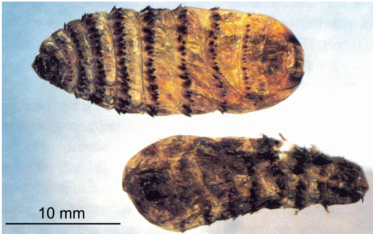
FIGURE 6. The bota of Gastrophilus intestinalis De Geer, 1776 from horse stomach, Ukok burial (Shokh, 2000, figure 278, p. 253). The photo was modified by the author.

June of that year (Engovatova et al., 2012). Human hairs from the abovementioned burial site of the Nadym settlement (twelfth – early eighteenth century) in the Yamal tundra forest were found to be infected by the head louse Pediculus humanus capitis De Geer, 1778 eggs (Vizgalov, 2013).