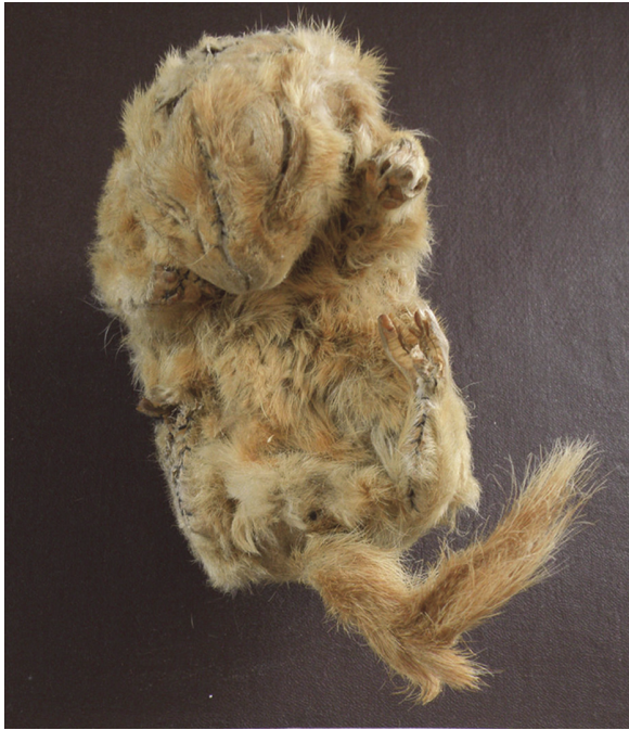
FIGURE 3. Spermophilus glacialis Vinogradov, 1948 (photograph by F.N. Golenishchev). Reproduced with permission of ZIN RAS.

abdominal contents are at the Geological Museum of the Institute of Diamond and Precious Metal Geology, Siberian Branch of RAS (Yakutsk). In its intestine loops and stomach, contents of the larvae of nematodes were found (species attribution not indicated) (Vereschagin, 1975).