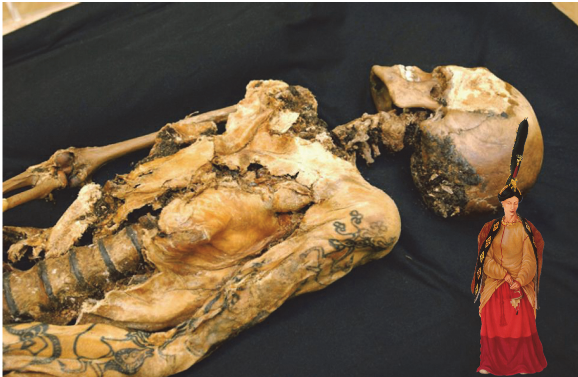
FIGURE 5. The woman mummy from Ukok and her reconstruction. The photo was modified by the author (photograph by K.A. Bannikov, V.P. Mylnikov and reconstruction by D.V. Pozdnyakov).

Quite often flies' puparia can be found alongside skeletal remains (Gautier, 1974; Gautier and Schumann, 1973; Germonpre and Leclercq, 1994; Heinrich, 1988; Lister, 2009). Even though one cannot exclude in-life (vital) myiasis in ancient animals, it is much more likely that the pupae populated the location after the animal's death. Thus, puparia findings (without species identification) have been reported in Russia for the woolly mammoth from Berelekh (Yakutia) (Figure 1) (Vereshchagin, 1977).