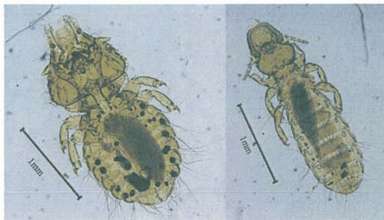
Fig. 2. chewing lice obtained from the Hodgson's Hawk Eagle Female Craspedorrhynchus sp. (A) and Degeeriella sp. (B)

male specimen obtained (Clay, 1958; Eichler, 1944; Mey, 2001). Both the present chewing lice are the first host records from S. nipalensis and the first geographical record of Degeeriella sp. from Japan.