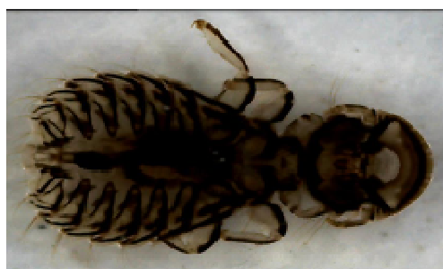
Male: Goniocotes gallinae (100 X)