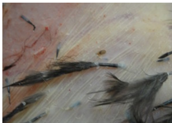
Picture.2 Inflammation and redness of the skin areas domestic turkey ( M. gallopavo ) eaten by lice and the emergence of paired areas scratches and bloody wounds and bleeding caused by lice bites and feather plucking

The second type of ticks Haemophysalis sp. Nymph be deemed to be it first recording in Iraq by the current study by infection percentage to 2%, which is lower than the recorded results by Asadollahi et al. (2014) in the south of Iran by infection percentage at 3.7%. There are also other species belonging to the genus Haemophysalis including H. sulcate which is one of diagnosed species and internationally known spread capacity; they are adults of this type present on the large animals usually like sheep, goats, cattle and camels causing her paralysis tick and factors vectors that cause animals and humans fever Q (Hoogstraal and Valdez, 1980).