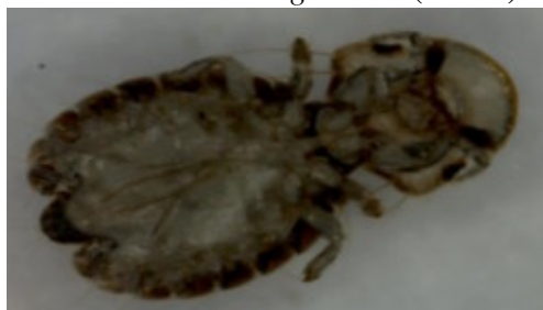
Male: Goniodes gigas (100 X)