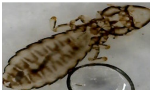
Male: Oxylipeurus sp. (40 X)