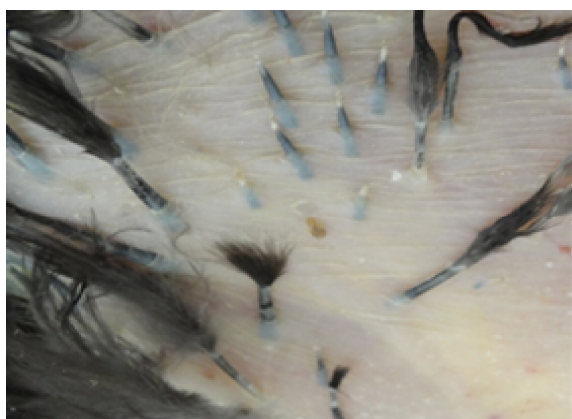
Picture.1 Break the feathers and the loss of the blade in domestic turkey ( M. gallopavo )