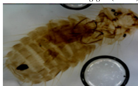
Female: Menacanthus straminus (40 X)