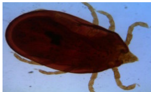
Ticks: Haemophysalis sp. Nymph