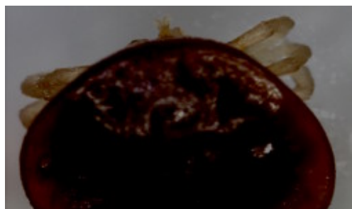
Tick: Argus persicus (40 X)