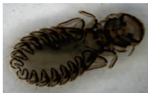
Female: Goniocotes gallinae (100 X)