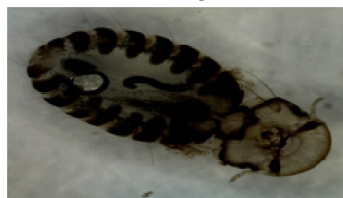
Female: Goniodes gigas (100 X)