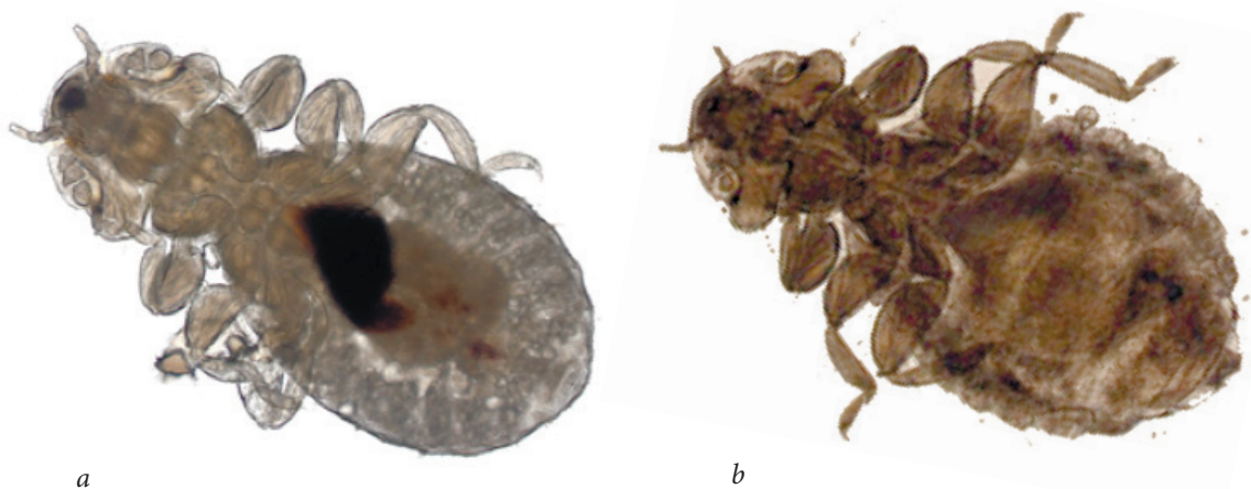
Fig. 3. Fam. Menoponidae: a — Bonomiella columbae — general view; b — Hohorstiella lata — general view.

Sex dimorphism is peculiar for all pigeon lice species revealed by us: males are smaller, than females (table 2).