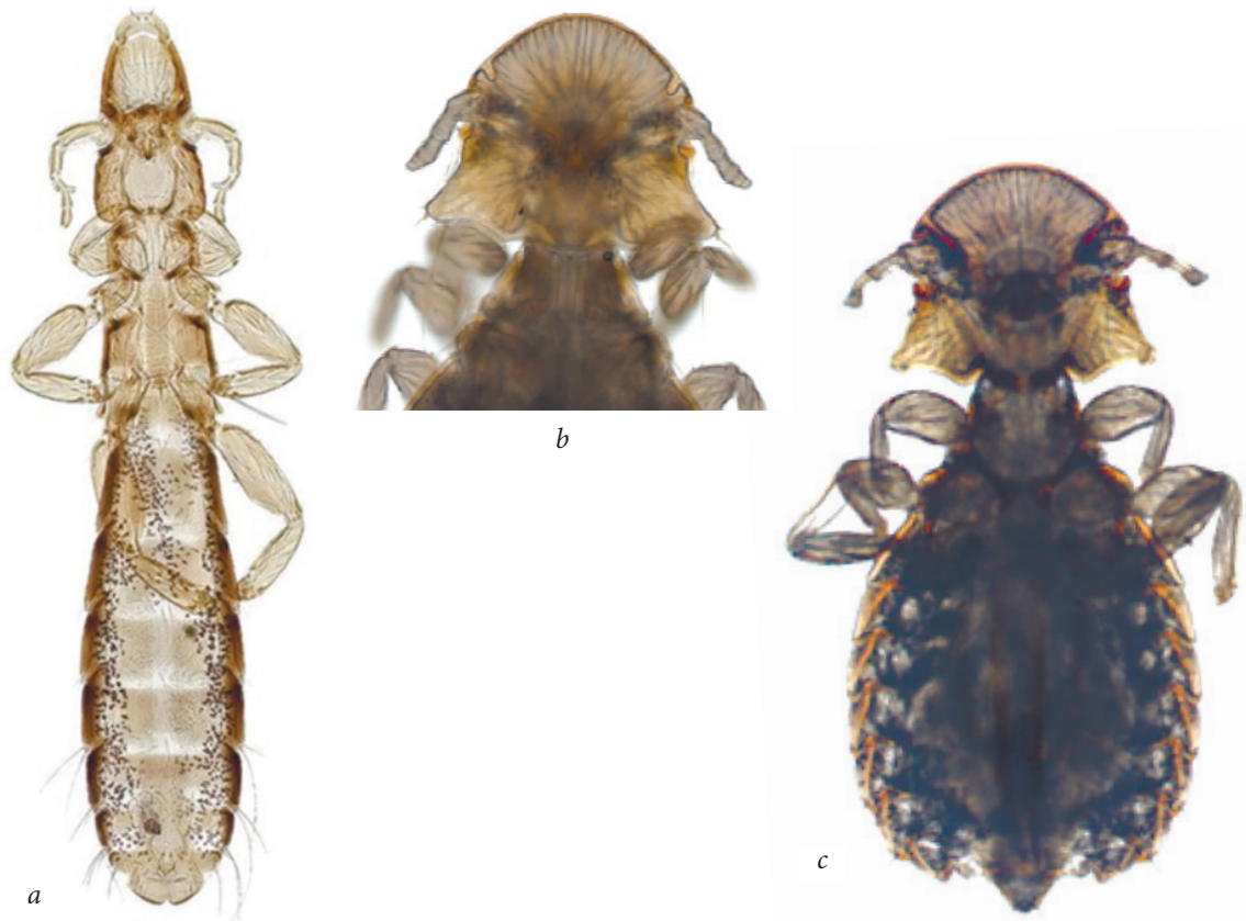
Fig. 1. Fam. Philopteridae: a — Columbicola columbae — general view; b — Companulotes compare — head; c — Companulotes compare — general view.

parasites are mainly localized nearer to the skin covering, they can also be found on accessory feathers and abdomen areas covered with down. They feed on down or lymph and blood. B. columbae is distinguished by considerable chitinization of the head and lateral parts of the thorax. This species is more mobile than the former one and differs from the other species by pale coloring. The degree of pigmentation somewhat increases on the head, feet, and on the tip of the abdomen. Despite their active movements, it is difficult to notice them among feathers. B. columbae differs from the other found species by a small head with prominent clypeus, and also the different shape and length of antennae. Their feet are thin and long.