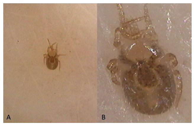
Fig. 2. (A) Dermoscopic aspect (×30) of a mite from the patient's back. (B) At high magnification (×150) the mite appears red-brown in colour with 4 pairs of limbs, and an ovoidal body engorged with blood.

What is your diagnosis? See next page for answer.