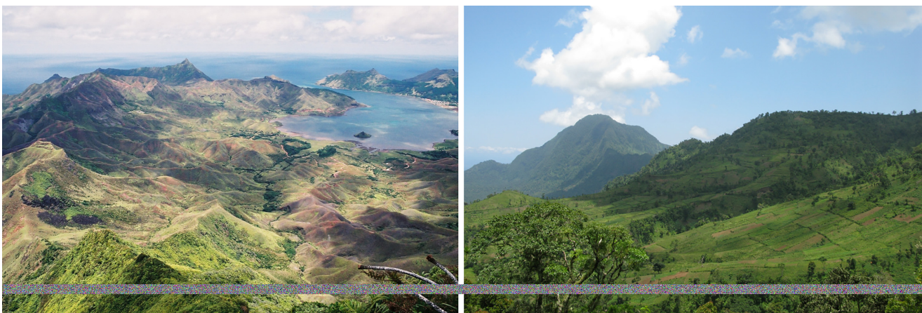
Fig. 6. Right: Tropical islands such as Anjouan in the Comoros, have suffered extensive deforestation for agriculture. Native vegetation is generally completely lacking at lower altitudes, and the highest ridges and mountaintops are now the last refuges of the remaining extant endemic species. Left: Other islands such as Rapa in the Austral Islands, French Polynesia, which has an area of only 40 km 2 and used to have more than 100 endemic land snail species, 59 endemic plant species and 67 endemic weevil species, are now mostly barren. Fires and overgrazing by introduced herbivores have destroyed much of the upper elevation habitat, and the vegetation at lower altitudes is dominated by invasive species.

Environmental health of the oceans is the subject of considerable media attention, that to a large extent tends to treat pollution (e.g. the “seventh continent” of plastic; Ter Halle & Perez, 2020), the collapse of fisheries, and extinction as