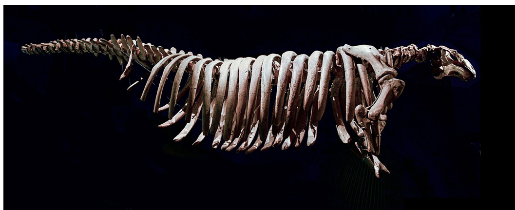
Fig. 7. Steller’s sea cow ( Hydrodamalis gigas (Zimmerman)), one of the few documented marine extinctions, skeleton in the Musée des Confluences, Lyon.

We agree with Roberts & Hawkins (1999, p. 245) that “what is now beyond doubt is that many marine species have