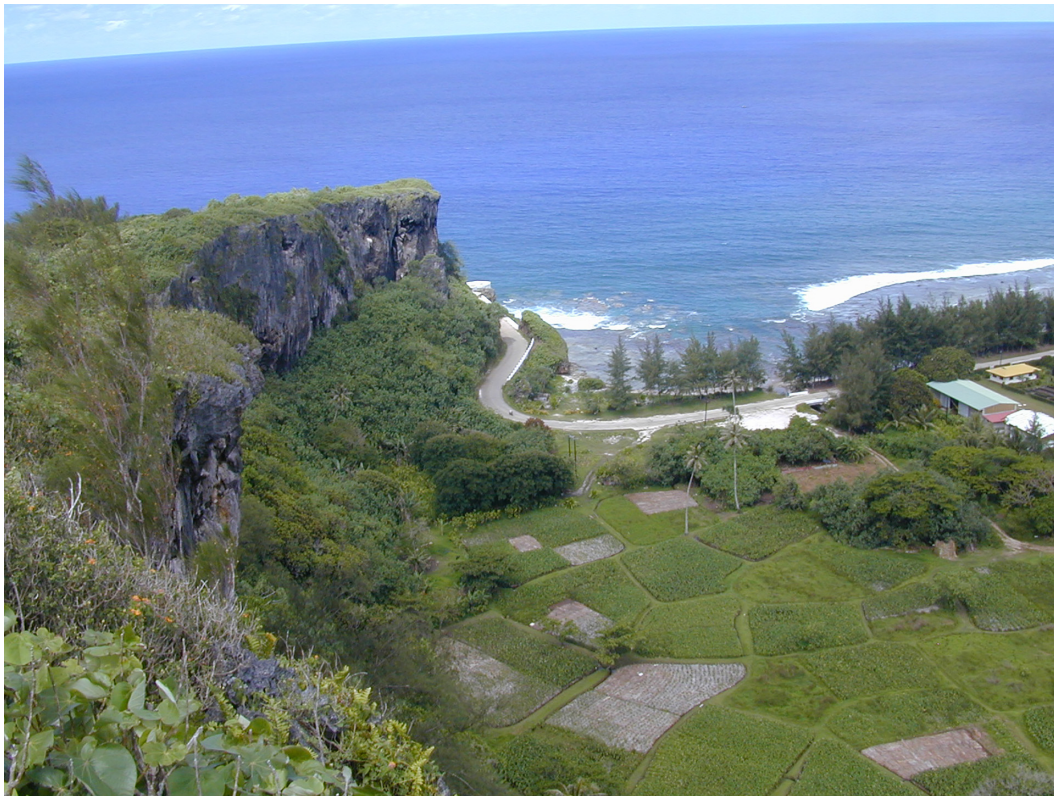
Fig. 5. Rurutu (Austral Islands, French Polynesia) was once home to 19 species of endemic Endodontidae (Mollusca). Despite extensive searches in the remaining patches of native vegetation, such as at the foot of this cliff, only empty shells were found. All 19 species are now considered extinct.

Our most recent numbers (Cowie et al. , 2017) are 638 species extinct, 380 possibly extinct, and 14 extinct in the wild, a total of 1,032 species in these combined categories, and more than twice as many as listed by IUCN (2020) in these categories (462). Furthermore, based on expert assessment of a rigorously random global sample of 200 land snail species (Régnier et al. , 2015a), extrapolation estimated that of the