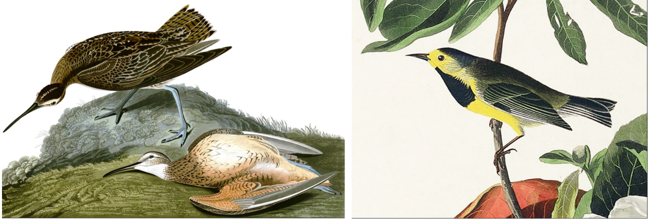
Fig. 2. Extinct but not listed as such, for fear of committing the ‘Romeo Error’. Left: Eskimo curlew ( Numenius borealis (Forster)), from Audubon (1827–1838: plate 208; Wikimedia Commons). Right: Bachman’s warbler ( Vermivora bachmani (Audubon)), from Audubon (1827–1838: plate 185 (detail); Creative Commons, Rawpixel).