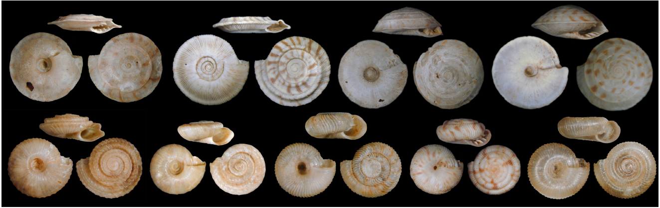
Fig. 4. Recently extinct Endodontidae from Rurutu (Austral Islands, French Polynesia).