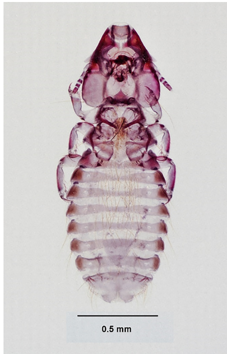
Fig. 3. Parasites, such as this louse (Phthiraptera, Rallicola pilgrimi Clay, collected June 2014, South Island, New Zealand), which went extinct when its host, the little spotted kiwi ( Apteryx owenii Gould), was transferred to predator-free islands (Buckley et al. , 2012), and which is not on the Red List , are almost completely unknown in the assessment of extinctions. Photograph: Creative Commons 4.0. Te Papa (A1.018470).

as a whole, based on Red List data, perhaps because higher vagility and concomitant larger range sizes reduce extinction risk in these highly volant groups.