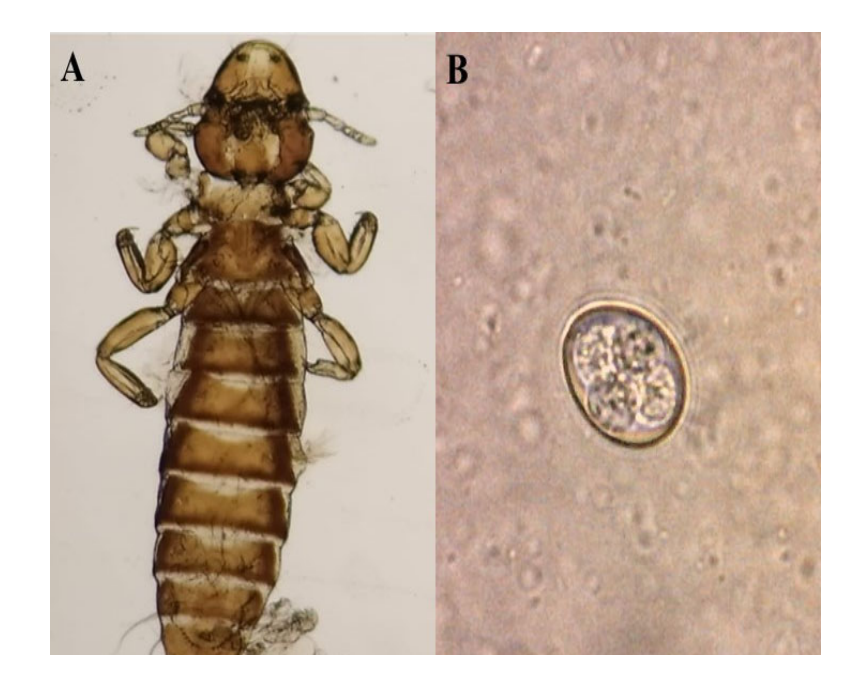
Figure 1 – Specimens of endo and ectoparasites found in N. hollandicus from different breedings. A: Louse of genus Neopsittaconirmus , observed in an estereomicroscope. B: Oocyst of genus Eimeria observed in microscope, 40x magnification.

In all breeding sites the cages are cleaned weekly, daily water exchange and, except birds of the third breeding, the other cockatiels had already been submitted to fecal exams and to the subsequent antiparasitic control about one year before the assessment. This factor may be one of the causes of the birds of the third breeding having the highest occurrence of parasites regarding to the others. Two breedings presented positive result for genus coccidia Eimeria in at least one fecal sample of N. hollandicus . The genus of coccidia was identified through oocyst morphology and host type where it was found. Sprenger et al. (2017) also found Eimeria spp. in N. hollandicus , and it may indicate that this endoparasite is commonly found in this bird species.