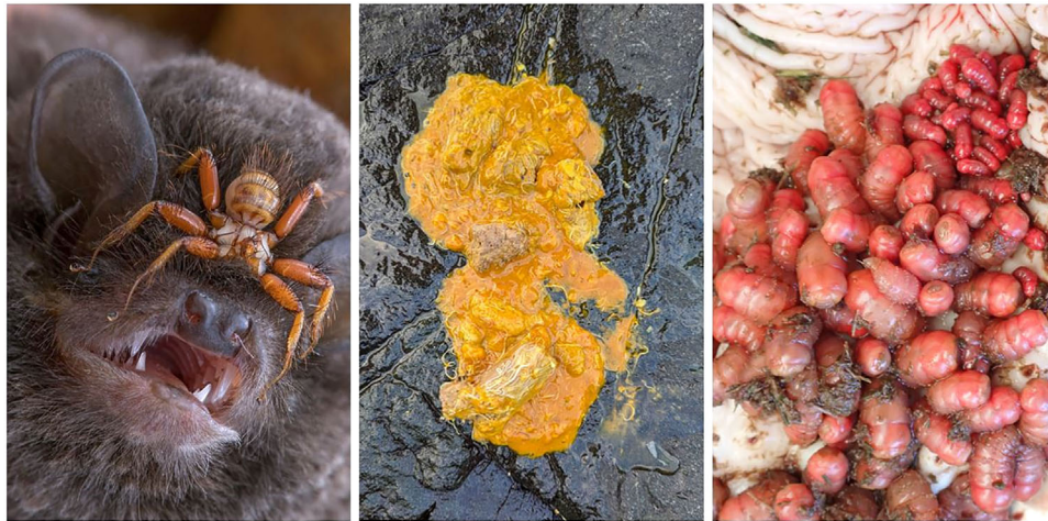
FIGURE 2 Overcoming human aversion to parasites and their life cycles will be a key part of gaining support for parasite conservation: (left) bat fly (Nycteribiidae) on a Mozambique long-fingered bat ( Miniopterus mossambicus ), (centre) helminths in the feces of a gray seal ( Halichoerus grypus ), and (right) botfly larvae ( Gasterophilus sp.) from the stomach of a mountain zebra ( Equus zebra ).

they conserve more charismatic species. Second, prioritizing individual host welfare at the expense of parasite conservation may represent a calculated value judgment that hosts are more valuable than parasites. This value judgment could be made across a number of different levels, from the decisions of individual practitioners to institutional, regulatory, and legislative requirements and guidelines. A key question is to understand the degree to which the lack of parasite conservation represents genuine opposition based on divergent conservation values, or to what extent it is the result of simply failing to appreciate the need to include parasites in conservation evaluations whether at the institutional or individual level.